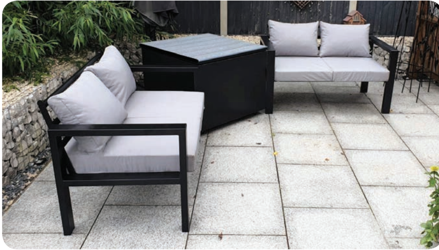
THE 'L' SHAPED SOFA SUITE

ALL OF OUR SOFA DESIGNS FEATURE OVERSIZED CUSHIONS FOR MAXIMUM COMFORT, IT'S LIKE BRINGING YOUR SOFA OUTSIDE!